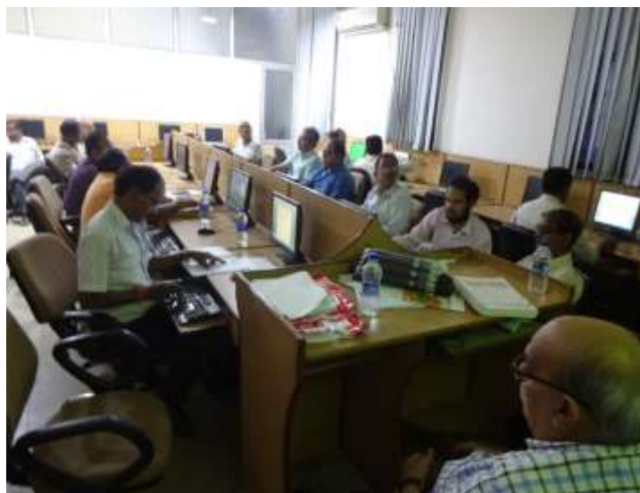
Computer Training session in progress