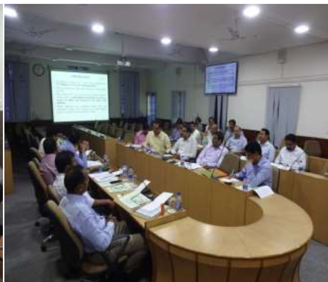
Training session in progress