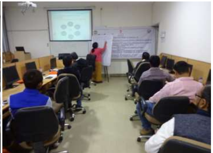
Participants during the training sessions

local governments and ensuring effective delivery of services, particularly to the urban poor;