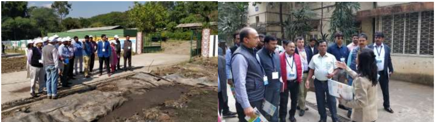
Participants during exposure visit to Wai City FSTP

AIILSG Mumbai, Wai had strategically planned and implemented FSSM by undertaking scheduled desludging for households and setting up an FSTP in the city. To ensure proper functioning of this system, the city government has planned to engage private sector to build and operate this facility. For this, they have introduced a sanitation tax to make sure that adequate funds will be available for operation and maintenance of this FSSM services. A 3-day training on FSSM and exposure visit to Wai, Maharashtra was organized under Sanitation Capacity Building Program (SCBP) by National Institute of Urban Affairs (NIUA) with All India Institute of Local Self Government (AIILSG) Mumbai to showcase the efforts undertaken by this city as a case-study to the participants.