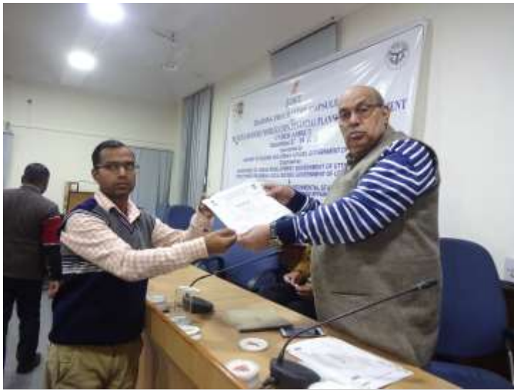
Certificate distribution ceremony

allowed to enjoy fiscal autonomy with freedom of choice in regard to imposing new taxes and revising tax rates. It is argued that municipal bodies are not financially strong enough to tap capital market for undertaking infrastructure works which involve huge capital investment, long gestation period. But the provision of marketing borrowing will certainly motivate the municipal bodies to revamp their financial strength to mobilize resources from market. There is also need to encourage private sector involvement in the development, strengthening and creator of urban infrastructure. Regional Centre for Urban and Environmental Studies, Lucknow organised a three days Training Programme on Training Programme on Resource Mobilisation, Financial Planning and Management under Capsule II under AMRUT, on 27-29 December, 2018 at RCUES, Lucknow.