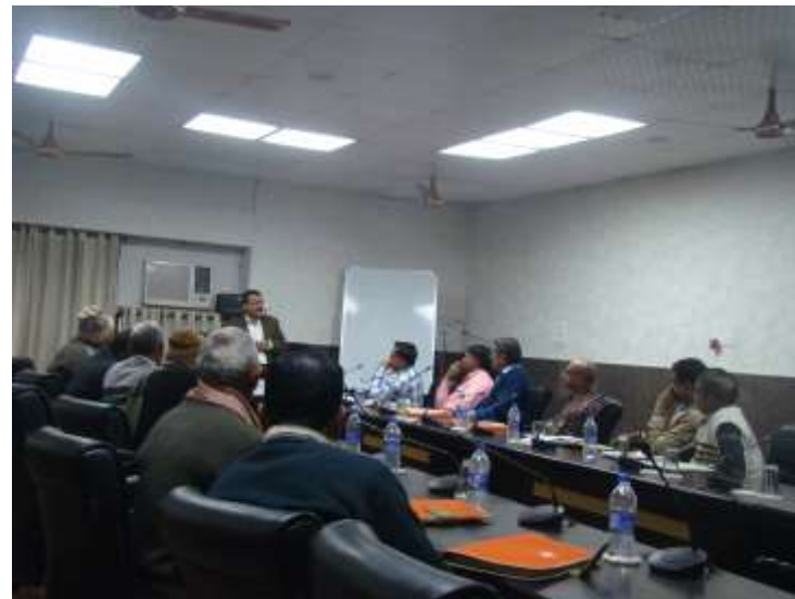
Training session in progress

The course contents included Enhancing Administrative Efficiency in ULBs; Strategy and Action Plan for Implementation of Reforms; Modern Office Management; Modern Office Management ; Preparation of MIS for Effective Monitoring of Projects ; Use of Software and Computer Applications for Enhancing Administrative Efficiency in ULBs ; Sources of Revenue in ULBs and Strategies for Revenue Enhancement ; Improving Municipal Services Delivery through e- governance ; Application of IT for Enhancing Service Delivery in ULBs;