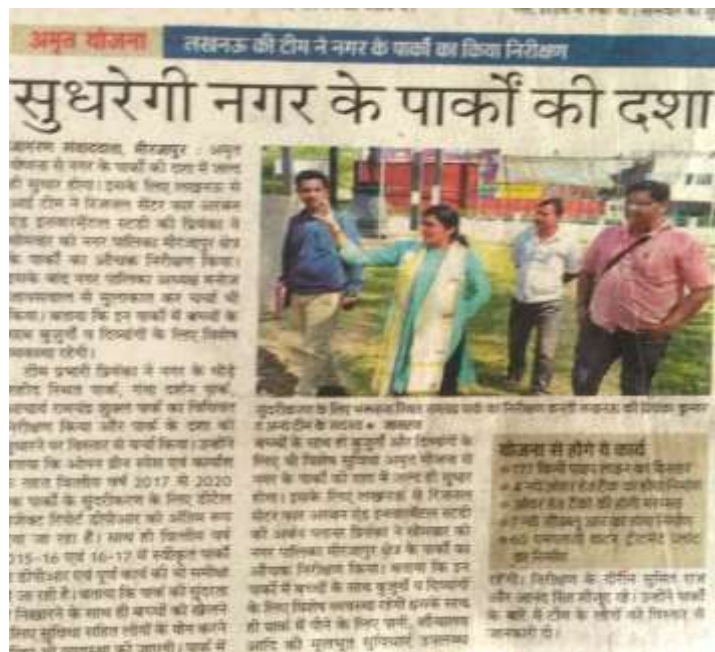
RCUES Team while visiting the parks and open spaces in Mirzapur

For development of Parks & open spaces under the AMRUT mission, RCUES Lucknow has been assigned the task of PDMC. As Project Development Management Consultants, conducted field visits & visited sites for Identification of open spaces for developing parks in AMRUT cities with Participatory Planning approach. Total of 87 park projects costing Rs 78.58 Cr has been prepared with the support of RCUES Lucknow. In which 73 park projects worth Rs 64.64 Cr have been approved by State Level Technical Committee meetings in Nov –Dec 2018. 57 park project tenders have