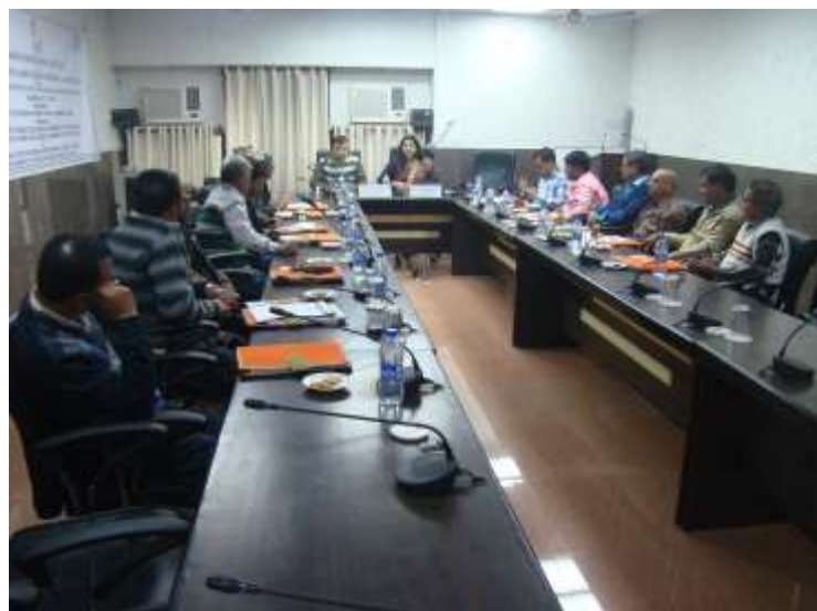
Training session in progress

should serve as a guide to ULBs in assessing their management strategies that are employed to ensure that they are operating efficiently and effectively. Computerization and introduction of ICT in Governance is important to maintain administrative efficiency. E-Governance is in essence, the application of Information and Communications Technology to government functioning in order to create 'Simple, Moral,