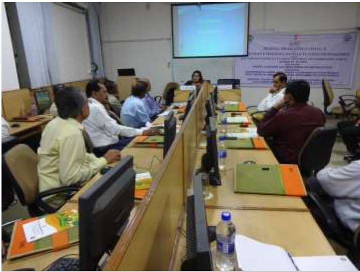
Participants during the training sessions