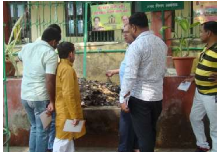
Participants during the exposure visit to Model Park in Lucknow

Exposure visits to best practices is an integral part of the orientation training programmes for elected representatives. With the objective of sharing and learning from good practices for enhancing the knowledge and replication of good models the elected representatives were taken for exposure visits to decentralized solid and liquid waste treatment models. The elected representatives had elaborate discussion with the practitioner. The Model House Park project of Lucknow was initiated by active participation of the citizens and ward member. This visit was a peer learning among the elected representatives which was very fruitful. The participants were also taken to a Bio Gas Digester Plant which is an innovative model of the state government for generating gas through treatment of animal shelter waste along with liquid waste at Kanha Upvan, Lucknow.