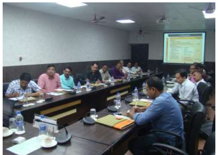
Participants during the training sessions